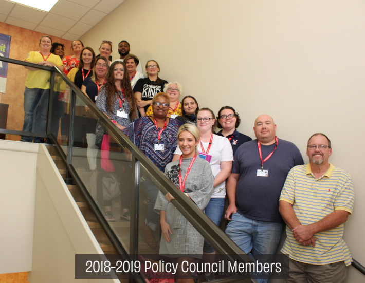
2018-2019 Policy Council Members